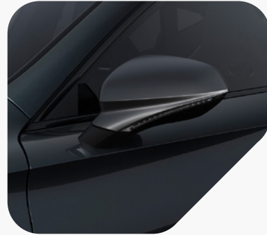
Magnetic Tech Grey