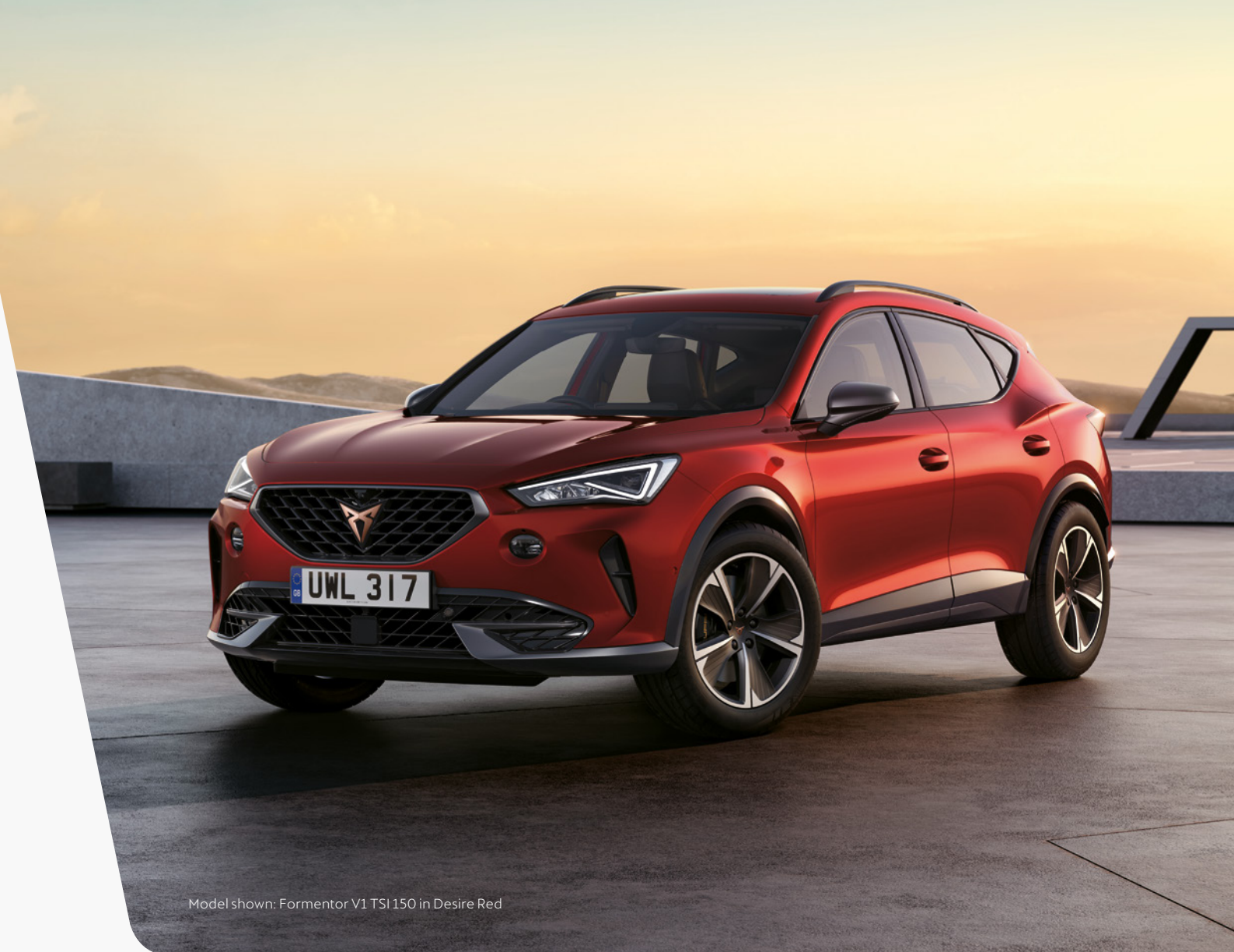
Model shown: Formentor V1 TSI 150 in Desire Red