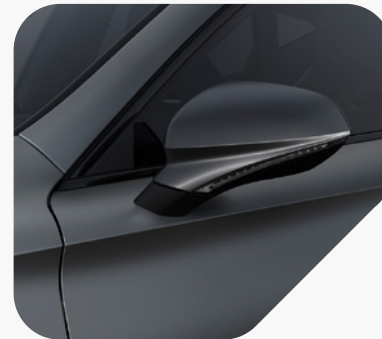
Matte Magnetic Tech Grey