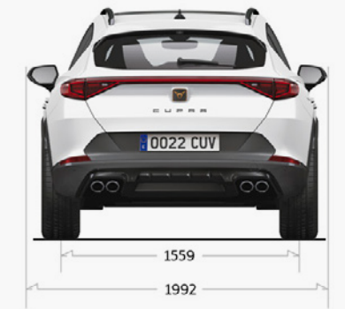
CUPRA Formentor 4Drive dimensions