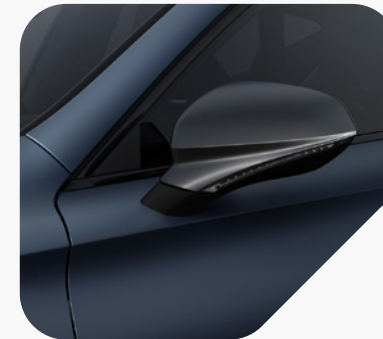
Matte Petrol Blue