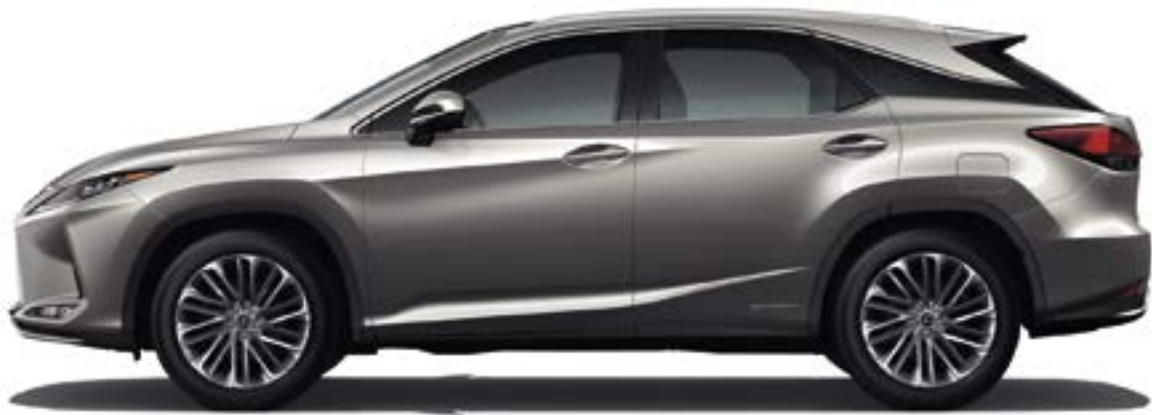
RX Takumi with Sonic Titanium Special Metallic Paint

Powered by our pioneering hybrid technology, the RX Self-Charging Hybrid intelligently combines a 3.5-litre V6 petrol engine with two electric motors, delivering seamless power to all four wheels. Thanks to the instantaneous torque of the electric motors, you can accelerate to 62 mph in as little as 7.7 seconds. At lower speeds, your RX will often switch to Electric Vehicle mode to drive in near silence, using no petrol and producing zero CO 2 or NO x . The RX's hybrid battery never needs charging and is compact, resulting in generous luggage space. Finally, you'll also be impressed how little it costs to run and service your RX compared to conventional luxury SUVs.