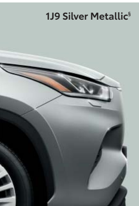
1J9 Silver Metallic 5