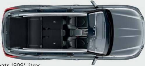
2 seats 1909* litres

The all new Toyota Highlander's interior can adapt to whatever you need to carry. If seven people are in the car, a 332-litre boot provides ample room for everyone's belongings. Fold down the back row, and that expands to 1909 litres. Fold down the second row, and the result is an astonishing 865 litres of storage. After sensing your Smart Key, the large rear doors open automatically when you wave your foot under the bumper. The panoramic glass roof with powered retractable sunshade allows you to let as much or little natural light in as you like.