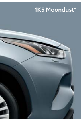
1K5 Moondust *