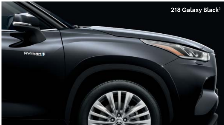
218 Galaxy Black 5