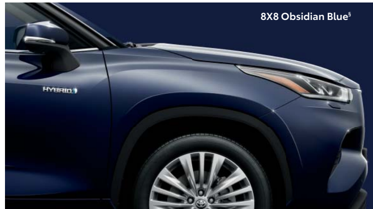
8X8 Obsidian Blue 6