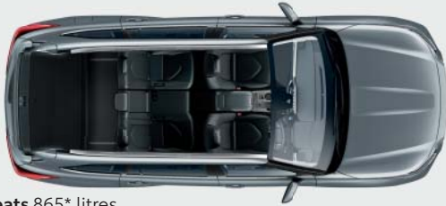
5 seats 865* litres