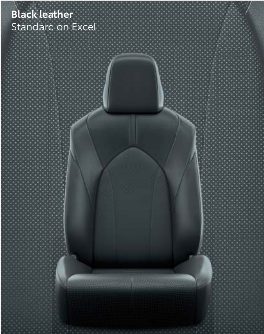
Black leather Standard on Excel