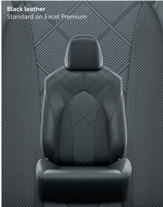
Black leather Standard on Excel Premium