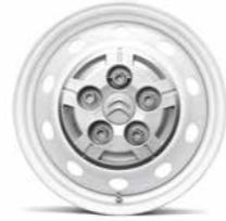
STANDARD STEEL WHEELS Tyres: 215/75 R16 C 35 Heavy Panel Vans